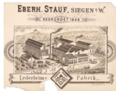
1862: Wilhelm Stauf

STAUF adhesives is born: Gerber Eberhard Stauf founds a glue boiling plant.